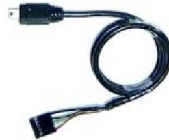
Y05-U13-060 (USB dupont 5PIN to B mini USB 5PIN cable) x1